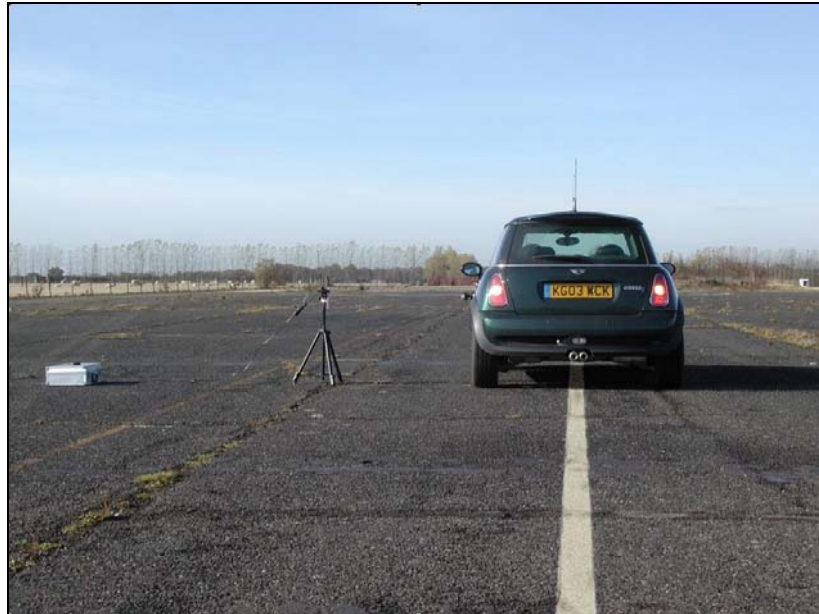
Test setup showing reflector on tripod and RTK base station

To perform a brake test, the vehicle was then driven down the centre line at a set speed, and once the reflector was passed, an ABS assisted brake stop was performed.